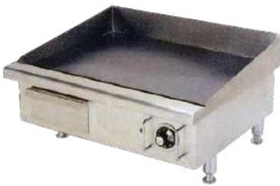
CODE: CT/198 ELECTRIC GRILL FULL GRILL

Model: EG-548-2 3KW Power: 220V Voltage: (555x473x293)m Size: m