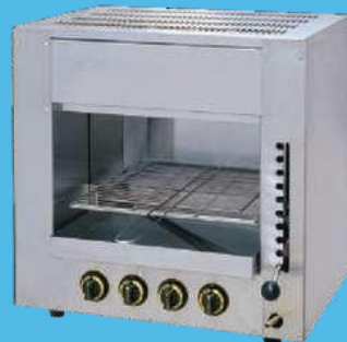
CODE: CT/342 GAS SALAMANDAR

Model: MHL580S Power: 6KW Voltage: 220V Size: (620x440x610)mm