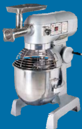
CODE: CT/203 FOOD MIXER & MINCER HEAD

Model: 20H Power: 750W Voltage: 220V Capacity: 20Lts Size: (415x530x780)mm Speed: 400 revolution/min