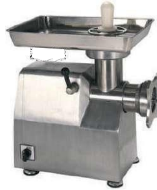
CODE: CT/143 MEAT MINCER 36KG 750W

Productivity: 120 Kg/h Size: (450x220x340)mm