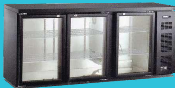
CODE: CF/175 GLASS DOOR UNDER COUNTER CHILLER 3 DOOR

Model: SG2 Volume Cu.Ft (L): 13Cu.Ft (340L) Doors: 2 Temperature: 0°C ~ 10°C Cooling System: Ventilated Controller Type: Digital Size (WDH): 1462x520x860mm