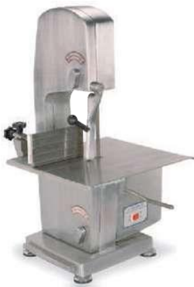
CODE: CT/207 BONE SAW 21MM TABLE TOP

Model: JG210 Power: 1300W Voltage: 380V Thickness: 30~250mm Sawing Speed: 15m/s Size: (712x780x1689)mm