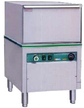
CODE: CT/330 GLASS WASHER

The wash temperature is showed in time. it is the perfect choice for your bar, cafe or coffee lounge. Simply select the desired wash cycle time