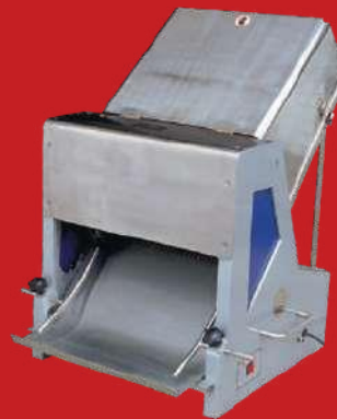
CODE: CT/169 BREAD SLICER

Model: FX-13A Power: 2.7KW Voltage: 220V Standard pans: 13 Pcs Size: (500x710x1740)mm