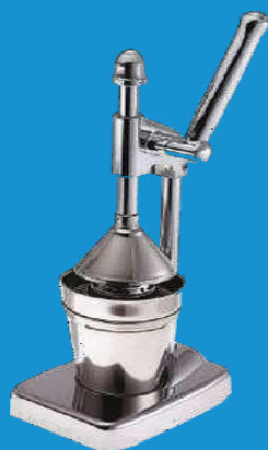
CODE: CT/286 MANUAL ORANGE/LEMON JUICER

Power: 220W Voltage: 220V-240V~50/60HZ, Max. Capacity: 8L Speed: 4000~18000rpm (8 grades)