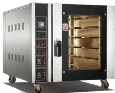
CODE: CT/297 ELECTRIC 5 TRAY CONVECTION OVEN

Model: YXD40 Power: 11.4KW Voltage: 380V No. of Trays: 4 Trays S size: (1210x750x1530)mm