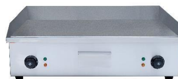
CODE: CT/468 ELECTRIC GRIDDLE (FLAT)

Model: CT/359 Power: 63MJ Size: (610x660x390)mm