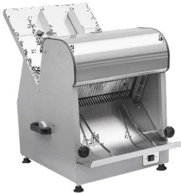
CODE: CT/455 31 BLADE BREAD SLICER

Power: 0.37KW Voltage: 220V Size: (720x546x720)mm