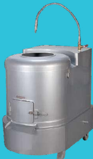
CODE: CT/187 POTATO PEELER 30KG

Model: PP15 Power: 750W Voltage: 220V Capacity: 15 Kgs(1–2 Min) Size: (475x540x785)mm