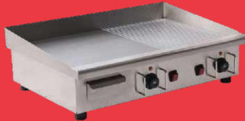
CODE: CT/199 ELECTRIC GRILL/GRIDDLE HALF GRILL HALF FLAT

Model: EG-738-2 Power: 4.4KW Voltage: 220V