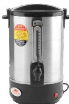
CODE: CT/292 MIXED [MILK & TEA] BOILER 16LTS

Power: 1.5KW Voltage: 220V Capacity: 16Lts