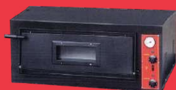
CODE: CT/232 SINGLE DECK PIZZA OVEN

Capacity: 12" pizza x 2pcs Voltage: 220-240V Power: 2.4 KW Temperature: 0~350°C Dimension: 585x550x430mm Chamber: 400x400x115mmx2Pcs