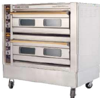
CODE: CT/214 2 DECK ELECTRIC OVEN

Model: PL4 Power: 12.8KW Voltage: 380V No. of Trays: 4 Trays Capacity: 80 Loaves/Hr S size: (1225x770x1240)mm