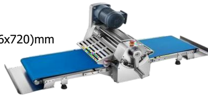
CODE: CT/454 FULL SS TABLETOP DOUGH SHEETER

Power: 0.37KW Voltage: 220V Size: (720x546x720)mm