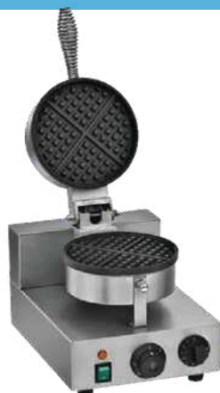
CODE: CT/128 SINGLE HEAD WAFFLE MAKER

Model: TT-150 Power: 1.94KW Voltage: 220V Output:150 – 270 Slices/h Size: (418x368x387)mm