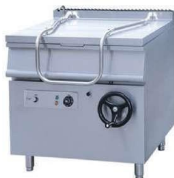
CODE: CT/326 TILTING BRAISING PAN MULTI TASKING

Model: EP-01-2 Power: 14.4KW Voltage: 380V Temperature: 50°C – 300°C Size: (890x1100x745) mm