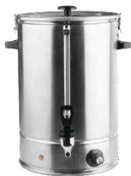
CODE: CT/113 ELECTRIC TEA URN WATER BOILER 10LTS WITH LEVEL INDICATOR

Power: 3KW Voltage: 220V Capacity: 10Lts