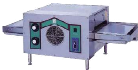
CODE: CT/162 ELECTRIC PIZZA CONVEYOR OVEN Model: YXD-1080 Power: 6.3KW Voltage: 220V Size: (1080x555x420)mm