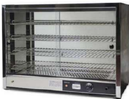
CODE: CT/323 HOT SNACK DISPLAY WARMER

Power: 1Kw Volts: 220-240V Size: (640x360x530)mm