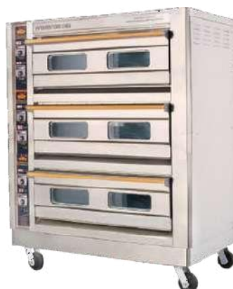
CODE: CT/217 3 DECK ELECTRIC OVEN

Model: PL4 Power: 12.8KW Voltage: 380V No. of Trays: 4 Trays Capacity: 80 Loaves/Hr S size: (1225x770x1240)mm