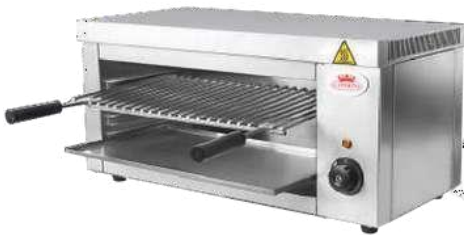
CODE: CT/172 ELECTRIC SALAMANDAR