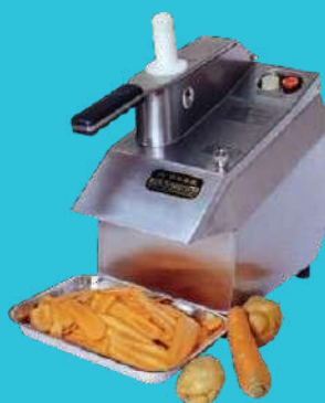
CODE: CT/274 POTATO CHIPS VEGETABLE CUTTER

Model: PP30 Power: 1500W Voltage: 220V Capacity: 30 Kgs (1 – 2 Min) Size: - (850x530x800)mm