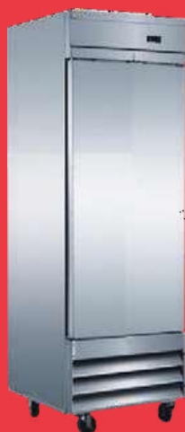
CODE: CF/103 SINGLE DOOR S/STEEL FREEZER 25CU.FT