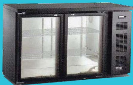
CODE: CF/174 GLASS DOOR UNDER COUNTER CHILLER 2 DOOR

Doors: 3 Temperature: 0°C ~ +10°C Refrigerant: R134a Size (WDH): 1875x700x850mm