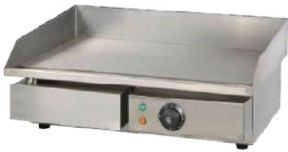
CODE: CT/131 ELECTRIC GRIDDLE