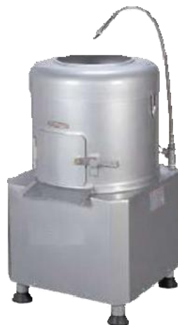
CODE: CT/145 POTATO PEELER 15KG

Model: PP8 Power: 370W Voltage: 220V Capacity: 8 Kgs (1–2 Min) Size: (430x430x725)mm