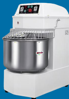
CODE: CT/212 60LT PLANETARY MIXER Model: CT/212 Power: 1.5/2.4KW Voltage: 415V Capacity: 60LTS

Model: CT/494 Power: 750W Voltage: 220V Capacity: 20Lts