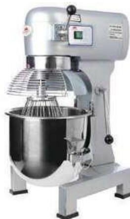
CODE: CT/163 FOOD AND DOUGH MIXER 20LTS

Model: 7H Power: 300W Voltage: 220V Capacity: 7Lts Size: (400X250X410)mm