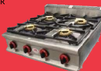
CODE: CT/362 TABLE TOP 4 BURNER COOKER

Burner: 3 Type: LPG gas valve Pan: Strong & durable Support: Size: 900x490x360mm