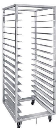
CODE: CT/439 16 TRAYS TROLLEY COOLING RACK