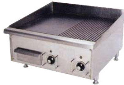
CODE: CT/200 ELECTRIC GRILL/GRIDDLE HALF GRILL HALF FLAT

Model: EG-548-2 3KW Power: 220V Voltage: (555x473x293)m Size: m