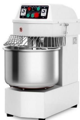
CODE: CT/448 30LT SPIRAL MIXER

Model: 40H Power: 1500W Voltage: 380V Capacity: 40Lts Size: (580x590x1230)mm Speed: 85~530 revolution/min