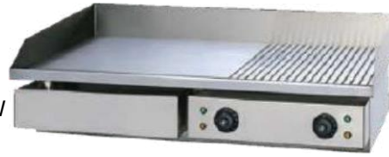
CODE: CT/132 ELECTRIC GRILL GRIDDLE