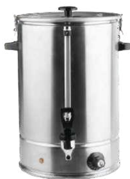
CODE: CT/114 ELECTRIC TEA URN WATER BOILER 20LTS WITH LEVEL INDICATOR

Power: 3KW Voltage: 220V Capacity: 20Lts