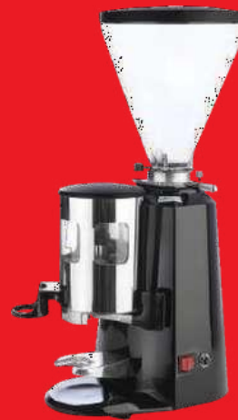
CODE: CT/452 PROFESSIONAL COFFEE GRINDER

Boil water, spray coffee powder and filter coffee automatically.