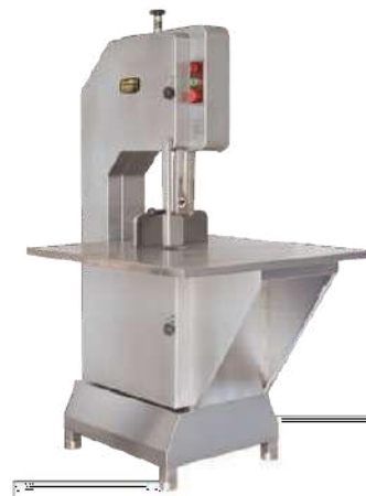
CODE: CT/168 BONE SAW 30MM + STAND

Model: JG210 Power: 1300W Voltage: 380V Thickness: 30~250mm Sawing Speed: 15m/s Size: (712x780x1689)mm