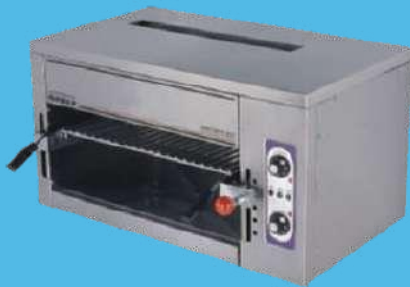
CODE: CT/201 ELECTRIC SALAMANDAR MANUAL ADJUST 58CM

Model: EB-600 Power: 4KW Voltage: 220V Size: (600x450x500)m