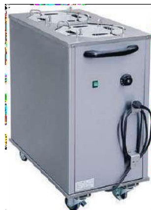
CODE: CT/332 PLATE WARMER 2x75

Plate diameter: Adjustable 8-12" Power: 1Kw Volts: 220-240V Size: (420x460x930)mm