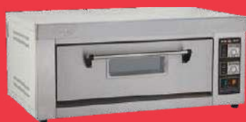
CODE: CT/135 SINGLE DECK ELECTRIC OVEN

Model: PL6 Power: 19.2KW Voltage: 380V No. of Trays: 6 Trays Capacity: 120 Loaves/Hr S size: (1225x770x1540)mm