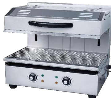
CODE: CT/483 ELECTRIC LIFTING SALAMANDAR

Model: RG16 Power: 35145 BTU/Hr Size: (880x440x610)mm