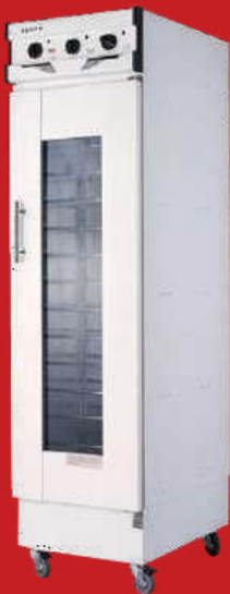
CODE: CT/213 PROVER

Model: FX-13A Power: 2.7KW Voltage: 220V Standard pans: 13 Pcs Size: (500x710x1740)mm