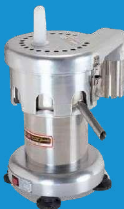
CODE: CT/183 HEAVY DUTY JUICER

Model: 1000JP Power: 450W Voltage: 220V Size: (400x260x350)mm