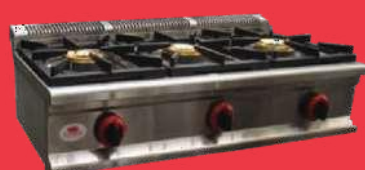
CODE: CT/361 TABLE TOP 3 BURNER COOKER

Burner: 2 Type: LPG gas valve Pan: Strong & durable Support: Size: 660x490x360mm