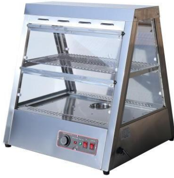
CODE: CT/480 FOOD DISPLAY WARMER

Power: 0.8 Kw Volts: 220V Size: (700x640x740)mm Temperature: 30-85°C