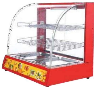
CODE: CT/366 PIE WARMER

The upper & lower layers can be equipped with orbit-rack or food-tray, special for displaying hamburgers and fried chickens.