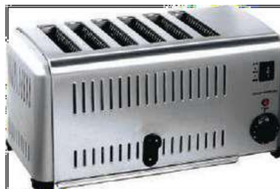
CODE: CT/126 6 SLOT TOASTER

Model: EB-6 3KW 220V Power: (460x210x225)m