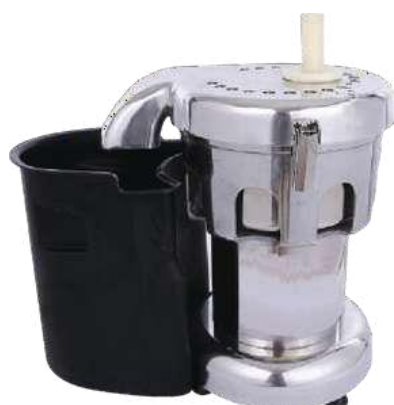
CODE: CT/322 HEAVY DUTY CARROT JUICER

Model: 1000JP Power: 450W Voltage: 220V Size: (400x260x350)mm