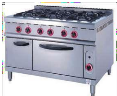
CODE: CT/334 6 GAS BURNER + OVEN - Power: 88992.8 BTU/Hr - Net Weight: 155Kg - Size: 1050x750x850+60 mm