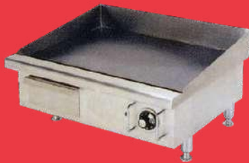
CODE: CT/197 ELECTRIC GRILL FULL GRILL

Model: EG-548-1 3KW Power: 220V Voltage: (555x473x293)m