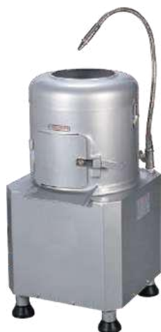
CODE: CT/144 POTATO PEELER 8KG

Model: PP8 Power: 370W Voltage: 220V Capacity: 8 Kgs (1–2 Min) Size: (430x430x725)mm