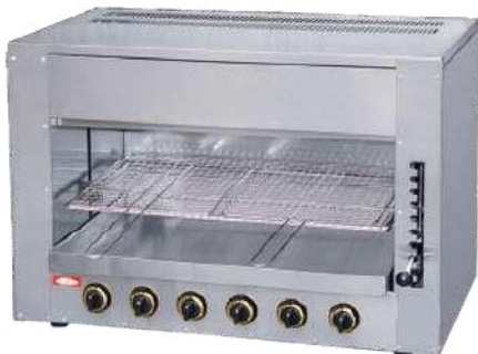
CODE: CT/343 GAS SALAMANDAR

Model: RG14 Power:: 23885 BTU/Hr Size: (800x610x460)mm