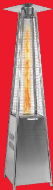
CODE: RG/536 OUTDOOR GAS HEATER