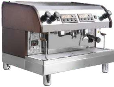
CODE: CT/450 CAPPUCCINO MACHINE