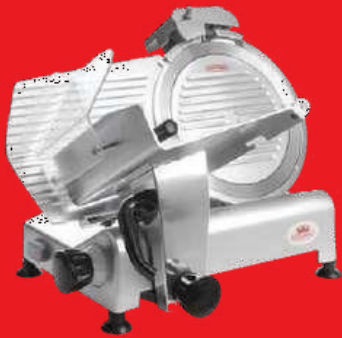
CODE: CT/146 MEAT SLICER 12" OPEN BLADE

Productivity: 220 Kg/h Size: (400x240x450)mm