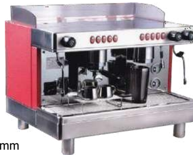
CODE: CT/451 CAPPUCCINO MACHINE 2 GROUP

Voltage: 220V Frequency: 50Hz Size: (700x540x550)mm