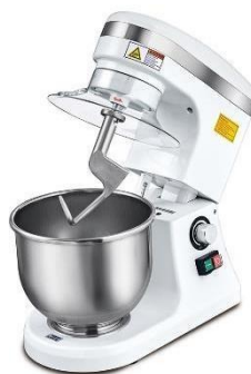
CODE: CT/492 7LT LUXURY FOOD MIXER

Model: CT/453 Power: 1.5KW Voltage: 380V Size: (465x275x310)mm