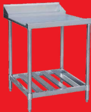
CODE: CT/341 DISH WASHER EXIT TABLE

- Dimensions: 120×74×86Cm - With waste discharge hole - With backsplash - Height 10cm.