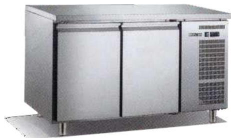
CODE: CF/164 STAINLESS STEEL UNDER COUNTER CHILLER 2 DOORS

Model: TG14 Volume Cu.Ft (L): 13Cu.Ft (318L)