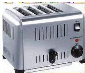
CODE: CT/125 4 SLOT TOASTER

Model: EB-4 2KW 220V Power: (370x210x225)m