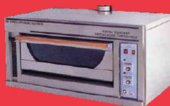
CODE: CT/276 GAS OVEN SINGLE DECK

Model: FR-12BQ Power: 60W Voltage: 220V Heat Load: 120Mj/Hr Gas: 2.8Kpa Pressure: S size: (1310x963x650)mm