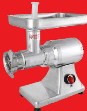
CODE: CT/433 MEAT MINCER 32#

Model: SS300 280W Power Blade: 500W 220V 1 – Power Slicer: 14mm 300mm Voltage: (576x624x727)m Slicing Thickness: m Diameter: Size: