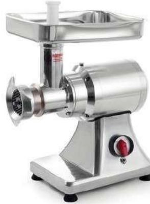
CODE: CT/432 MEAT MINCER 22#

Power: 550W Voltage: 220V/50Hz Capacity: 100Kg/h N.W./G.W.: 21.5/24.5 Kg