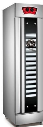
CODE: CT/447 16 TRAYS PROOFER

Model: CT/447 Power: 2.6KW Voltage: 220v Size: (500x700x1980)mm Capacity: 16 Tray