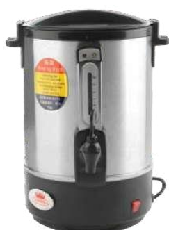
CODE: CT/291 MIXED [MILK & TEA] BOILER 12LTS

Power: 1.5KW Voltage: 220V Capacity: 12Lts