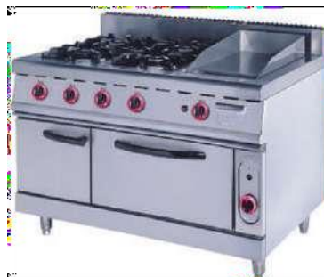
CODE: CT/327 4 GAS BURNER OVEN + GRIDDLE - Power: 79500 BTU/Hr - Net Weight: 212Kg - Size: 1200x900x850+120 mm