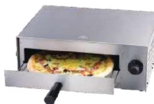
CODE: CT/337 PIZZA MAKER SINGLE Timer: 15 minutes Power: 1.75Kw Voltage: 240V Size: (580x500x170)mm