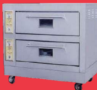
CODE: CT/234 DOUBLE DECK ELECTRIC OVEN

Model: YXD20 5.7KW 220V Power: 2 Trays Voltage: (1210x750x520)m No. of Trays: m S size: