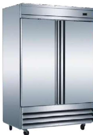
CODE: CF/102 DOUBLE DOOR S/STEEL FRIDGE 50CU.FT