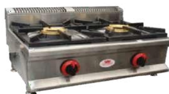
CODE: CT/360 TABLE TOP 2 BURNER COOKER

Effectively designed for multi-tasking, such as frying, boiling, grilling and simmering