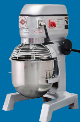
CODE: CT/494 20LT PLANETARY MIXER

Model: CT/494 Power: 750W Voltage: 220V Capacity: 20Lts