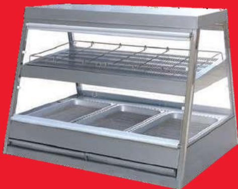
CODE: CT/324 HOT FOOD DISPLAY WARMER

Keep warm & humidity, even temperature, two sides with heat resistance glass.