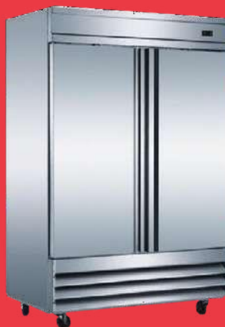
CODE: CF/104 DOUBLE DOOR S/STEEL FREEZER 50CU.FT