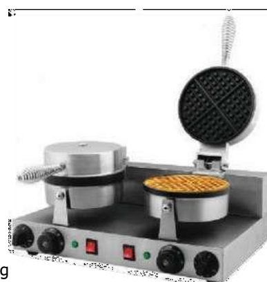
CODE: CT/281 DOUBLE HEAD WAFFLE MAKER

Model: UWB-2 1KWx2 Power: 220V Voltage:(500x380x300) Size: m