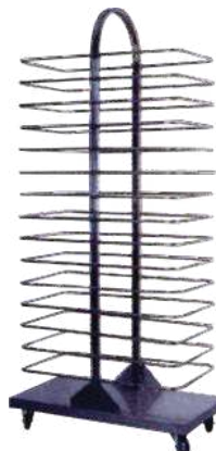
CODE: CT/243 STEEL SHELF RACK

Model: PJ-15 Size: (680x550x1800)mm Weight: 14Kgs