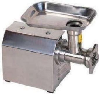
CODE: CT/142 MEAT MINCER 25KG 650W