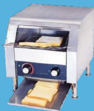
CODE: CT/233 ELECTRIC CONVEYOR TOASTER

Model: TT-300 Power: 1.94KW Voltage: 220V Output:300 – 350 Slices/h Size: (418x368x387)mm