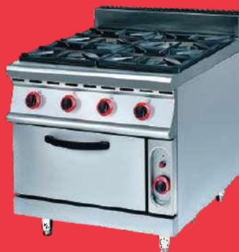
CODE: CT/171 4 GAS BURNER + ELECTRIC OVEN Model: ZH-TT Power Gas: 117,744 B.T.U/h Power: 4.8KW Size: (800x900x850)mm