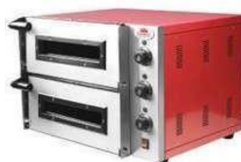
CODE: CT/358 2 DECK PIZZA OVEN

Model: GR4 Power: 0.2KW Voltage: 220-240V Gas Pressure: 2.8Kpa Heat Load: 90Mj/Hr Size: (1355x800x1410)mm