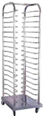
CODE: CT/242 STEEL SHELF RACK

Power: 0.43KW. Slicing thickness: 12mm. Pieces/time: 30. Size: (650x740x750)mm. Production capacity: 200 - 350 Loaves per hour