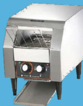
CODE: CT/363 ELECTRIC CONVEYOR TOASTER

Model: TT-300 Power: 1.94KW Voltage: 220V Output:300 – 350 Slices/h Size: (418x368x387)mm