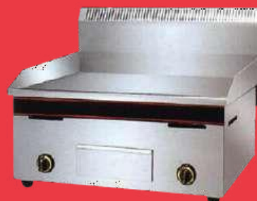
CODE: CT/240 GAS GRILL/GRIDDLE

Model: GH-720 Power Gas: 36,000 B.T.U. Ignition: Electronic Size: (730x550x550)mm