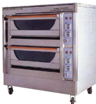
CODE: CT/277 GAS OVEN DOUBLE DECK

Model: GR4 Power: 0.2KW Voltage: 220-240V Gas Pressure: 2.8Kpa Heat Load: 90Mj/Hr Size: (1355x800x1410)mm