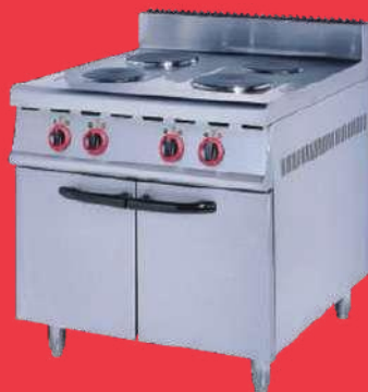
CODE: CT/336 4 PLATE ELECTRIC COOKER +CABINET Power: 14Kw Voltage: 380V Net Weight: 104Kg Size: (800x800x850+120)mm