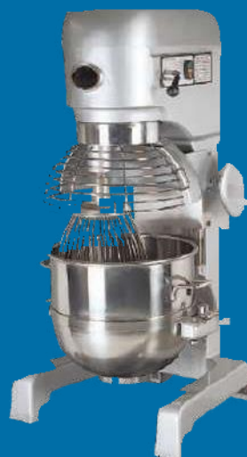
CODE: CT/164 FOOD AND DOUGH MIXER 40LTS

Model: B20FA Power: 750W Voltage: 220V Capacity: 20Lts Size: (415x630x885)mm Speed: 400 revolution/min