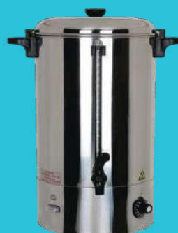
CODE: CT/367 S/STEEL MIXED [MILK & TEA] BOILER 10LTS

Power: 2KW 220V Voltage: 10Lts 30°C - Capacity: 110°C