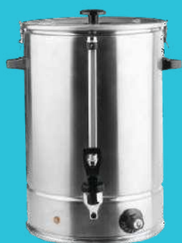
CODE: CT/115 ELECTRIC TEA URN WATER BOILER 30LTS WITH LEVEL INDICATOR

Power: 3KW Voltage: 220V Capacity: 30Lts