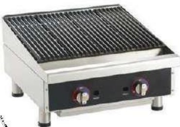
CODE: CT/359 GAS GRIDDLE BBQ LAVA ROCK

Model: GH-722 Power Gas: 36,000 B.T.U. Ignition: Electronic Size: (730x550x550) mm