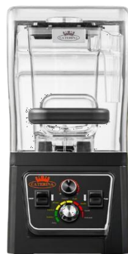
CODE: CT/421 PROFESSIONAL SOUND INSULATED BLENDER

Model: WF-B2000 Power: 500W Voltage: 220V Speed: 2800rpm