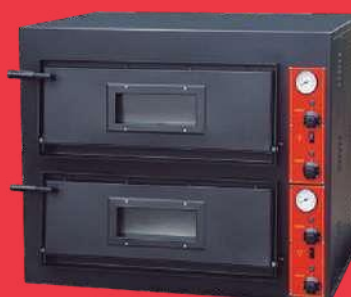
CODE: CT/231 DOUBLE DECK PIZZA OVEN

Model: EP-01-1 Power: 7.2KW Voltage: 380V Temperature: 50°C – 300°C Size: (890x1100x430)mm