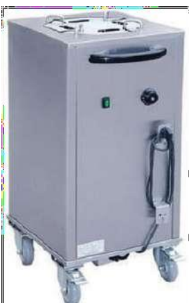
CODE: CT/331 PLATE WARMER 1x75

- Dimensions: 70×74×86 cm - With backsplash - Height 10cm.