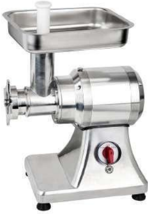
CODE: CT/431 MEAT MINCER 12#

Power: 550W Voltage: 220V/50Hz Capacity: 100Kg/h N.W./G.W.: 21.5/24.5 Kg