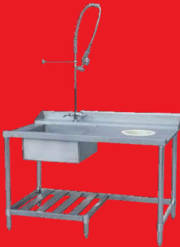
CODE: CT/340 DISH WASHER PRE-CLEANING TABLE

Rinse tank heater: 2.4Kw/6Kw(380V) Rinse temperature: 82°C Electrical input: 240V/380V 50Hz Hot water input: 200Kpa-400Kpa Size: 500x550x850 mm