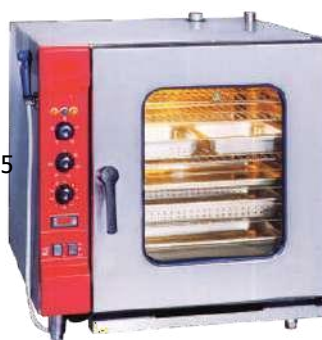
CODE: CT/328 ELECTRIC COMBI STEAMER S/STEEL GRID SHELF

Model: NFC5D 9KW 415V 5 Power: Trays Voltage: (900x1110x730)m No. of Trays: m S size: