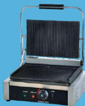
CODE: CT/174 SINGLE HEAD TOASTER GRILL PRESS

Model: GH-811E Power: 3.6KW Voltage:220V Temp: 50°C – 300°C Size: (300x330x200)mm