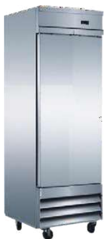
CODE: CF/101 SINGLE DOOR S/STEEL FRIDGE 25CU.FT