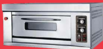
CODE: CT/283 GAS OVEN SINGLE DECK

Model: 18Kw/9KW Power: 380V Voltage: 4 Trays No. of Trays: (867x930x930)mm S size: