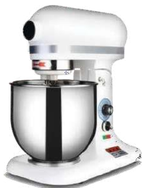
CODE: CT/165 FOOD AND DOUGH MIXER 7LTS

Model: 7H Power: 300W Voltage: 220V Capacity: 7Lts Size: (400X250X410)mm