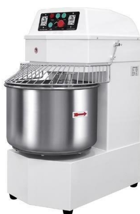
CODE: CT/449 60LT SPIRAL MIXER

Model: EF101 Power: 1.5KW Voltage: 220V Capacity: 30LT