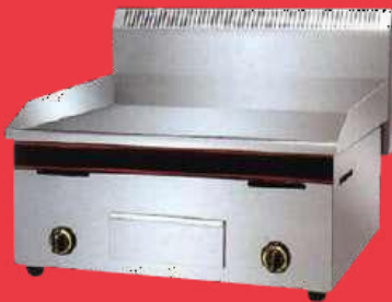
CODE: CT/239 GAS GRIDDLE

Model: EG-618-2 Power: 6KW Voltage: 220V Size: (620x613x365)mm