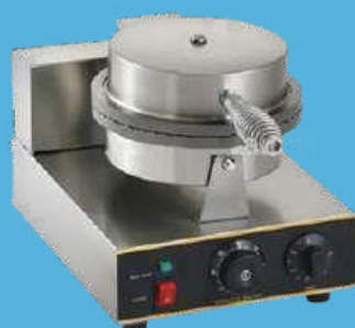
CODE: CT/364 ELECTRIC CONE WAFFLE MAKER WITH CONE

Model: Power: 1KW Voltage: 220V Size: (360x250x230)mm