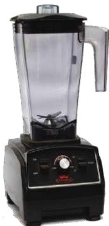
CODE: CT/405 COMMERCIAL BLENDER 2200W

2200W motor Variable speed, pulse function control High quality stainless steel blades High quality durable polycarbonate jar 2.8Lts Special fruit & vegetable chopping function Speed - 3000rpm