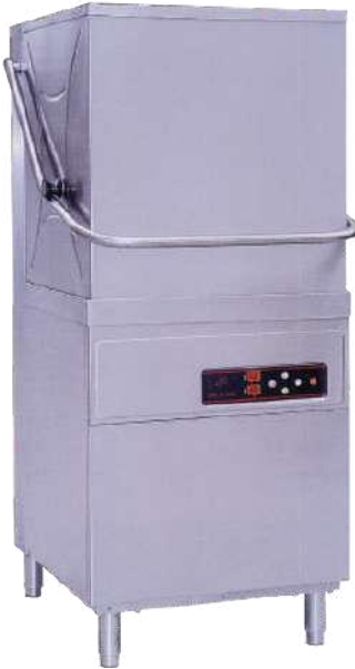
CODE: CT/329 DISH WASHER

Capacity: 900 Plates (12")/Hr Rinse cycle: 60/90/120 Seconds Wash pump: 0.735Kw Wash tank capacity: 33Lts Wash tank heater: 3Kw Wash temperature: 60°C