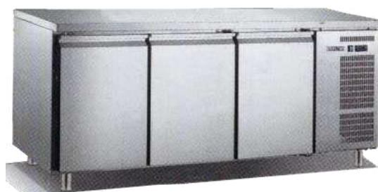
CODE: CF/165 STAINLESS STEEL UNDER COUNTER CHILLER 3 DOORS

Doors: 2 Temperature: 0°C ~ +10°C Refrigerant: R134a Size (WDH): 1400x700x850mm