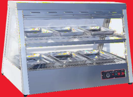
CODE: CT/481 FOOD DISPLAY WARMER

Power: 0.8 Kw Volts: 220V Size: (700x640x740)mm Temperature: 30-85°C