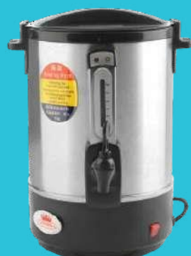
CODE: CT/293 MIXED [MILK & TEA] BOILER 30LTS

Power: 1.5KW Voltage: 220V Capacity: 30Lts