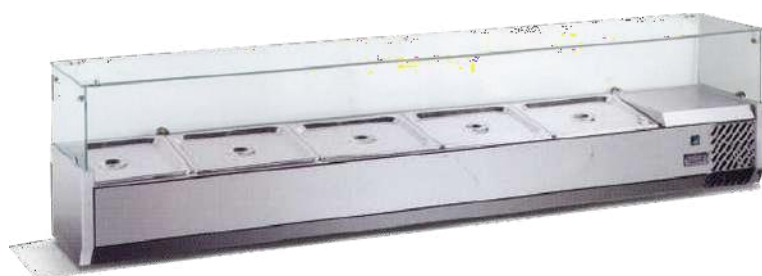
CODE: CF/185 SALAD SHOWCASE

Model: SG3 Volume Cu.Ft (L): 19Cu.Ft (510L) Doors: 3 Temperature: 0°C ~ 10°C Cooling System: Ventilated Controller Type: Digital Size (WDH): 2002x520x860mm