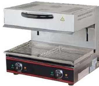
CODE: CT/173 ELECTRIC SALAMANDAR AUTO ADJUST 60CM

Model: AT-936 2KW 220V Power: (570x340x260)m Voltage: m Size: