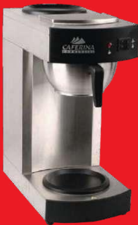
CODE: CT/325 COFFEE MAKER/WARMER

Power: 2.1Kw Volts: 220-240V Size: (219x419x478)mm